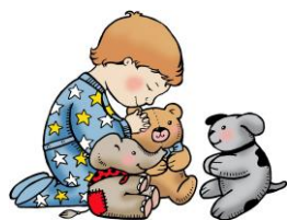
God Hears and Answers Prayers

For when two or three are gathered in my name, I am there among them. (Matthew 18:20)