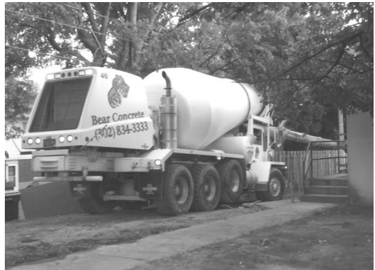
Hauling in the concrete