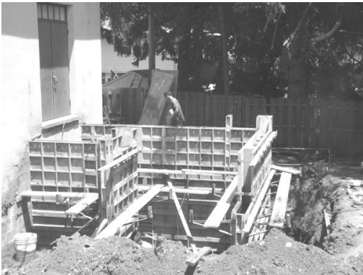
Demolition and Reforming exit