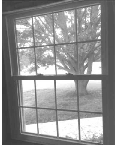
Replacement of 27 windows in Parish House