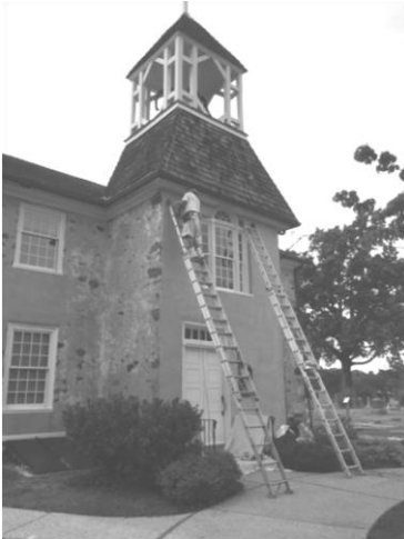
Church repairs and painting