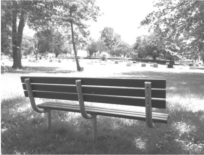
View from the Saviak memorial bench looking up towards the Church from Old Capital Trail