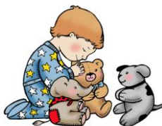
God Hears and Answers Prayers