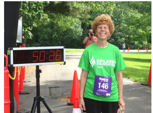
After coming over the finish line at 49:42

Thanks again for supporting me in the Epilepsy 5K walk! Here are some pictures of me at the walk on June 2, 2018. With your help, I raised $7,255.75 in my 26 th year of participation in the walk. It was my best year yet! I'll be seeing you next year! ☺