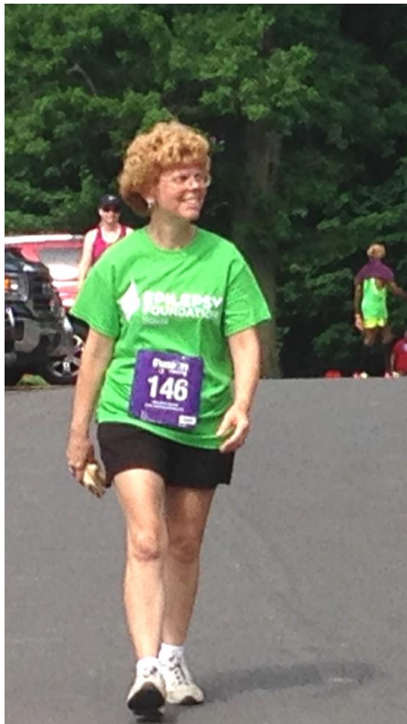
On my way in !!